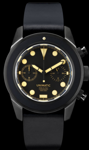
U3-AN, 2018 Edition of 300 pieces