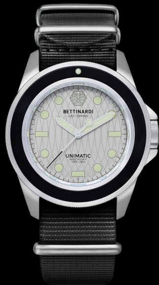
U1-BF, 2024 Edition of 50 pieces