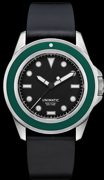
U1S-FAI, 2022 Edition of 200 pieces in collaboration with FONDO AMBIENTE ITALIANO