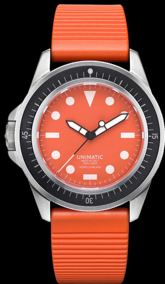
U1-GM, 2021 Edition of 100 pieces in collaboration with GRIMOLDI Milano