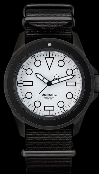
U1-DWN, 2017 Edition of 150 pieces