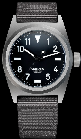
U2-B, 2017 Edition of 400 pieces