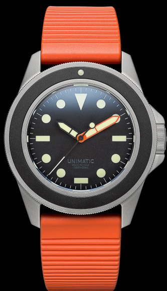
U1-MLB, 2021 Edition of 200 pieces