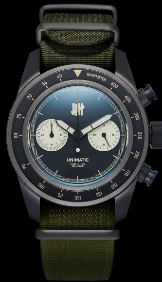
U3-ULVN, 2023 Edition of 99 pieces