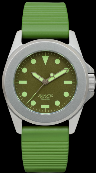
U4S-HM, 2023 Edition of 75 pieces