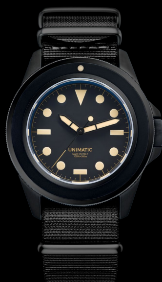
U1-BN, 2016 Edition of 40 pieces