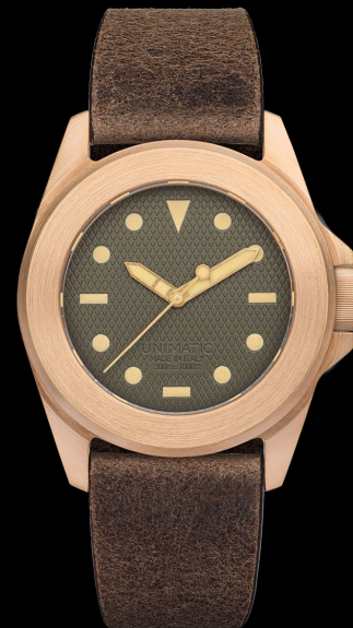
U4S-BRZ-MLL, 2022 Friends and family, edition of 99 pieces