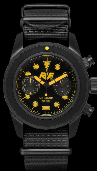
U3-RUF-B, 2024 Edition of 100 pieces