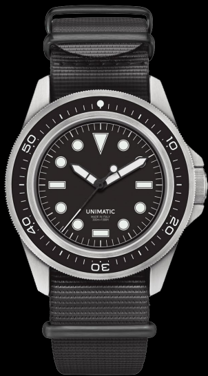
U1-PD3-B, 2025 Edition of 300 pieces