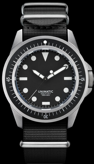
U1-F, 2019 Edition of 600 pieces