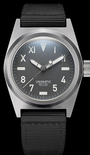
U2-H, 2021 Edition of 500 pieces