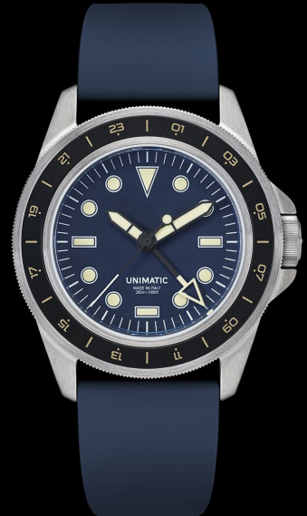
U1-GMT-DHN, 2025 Edition of 300 pieces