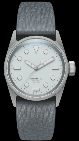
UT5-GO, 2025 Edition of 300 pieces