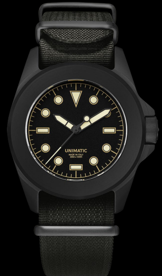
U4S-8BB, 2024 Edition of 99 pieces