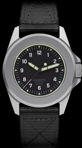
UT4-B, 2023 Edition of 300 pieces