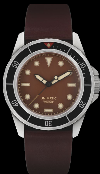
U1-ML6, 2020 Edition of 99 pieces in collaboration with MASSENA LAB