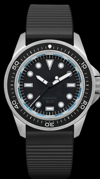
U1S-PD5, 2023 Edition of 500 pieces