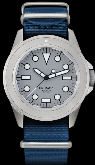
U1-EG, 2018 Edition of 30 pieces in collaboration with GOODS Copenhagen