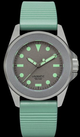
U4S-HG, 2023 Edition of 75 pieces