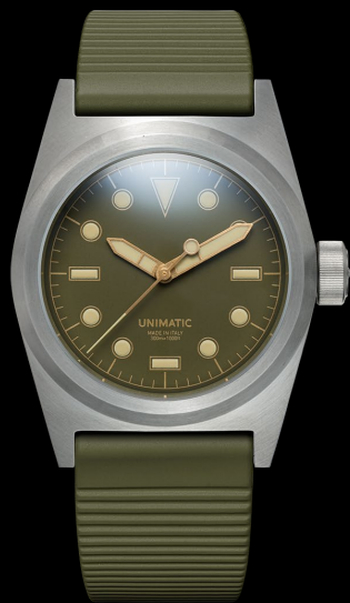
U2S-80, 2023 Edition of 400 pieces