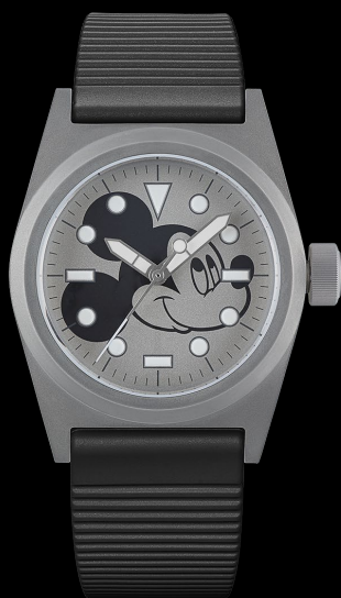
U2S-T-HS, 2023 Edition of 100 pieces