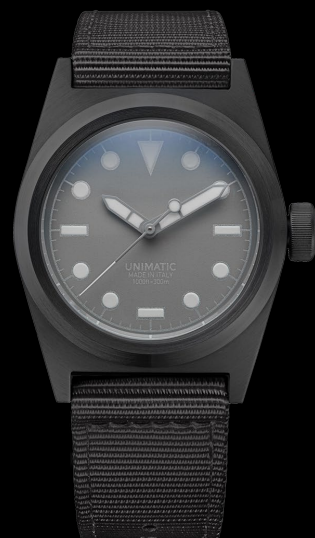
U2-FN, 2020 Edition of 250 pieces