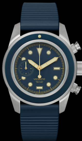
U3-8N, 2023 Edition of 400 pieces