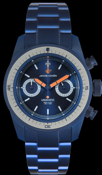
U3-JC, 2025 Edition of 100 pieces in collaboration with JACOB COHEN