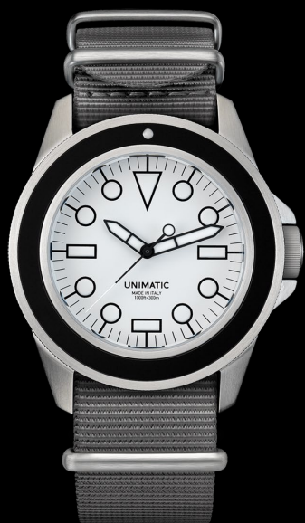
U1-DW, 2017 Edition of 200 pieces