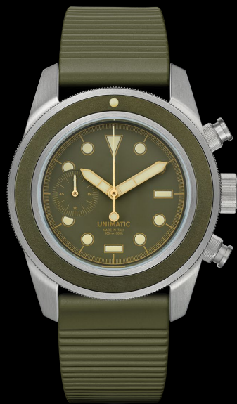
U3-80, 2023 Edition of 400 pieces