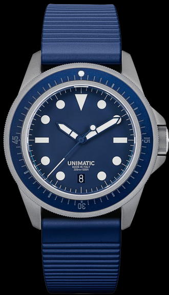
U1S-T-MP, 2022 Edition of 500 pieces