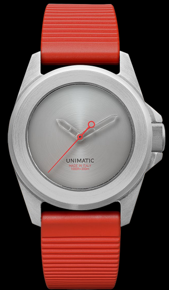
U4S-ME0S, 2023 Edition of 99 pieces