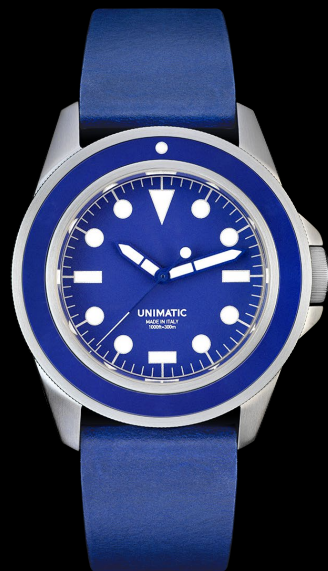
U1-MP, 2018 Edition of 100 pieces in collaboration with MR PORTER