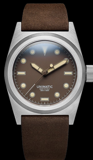
U2S-MB, 2022 Edition of 500 pieces