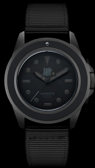
U1-UN, 2020 Friends and family, edition of 20 pieces