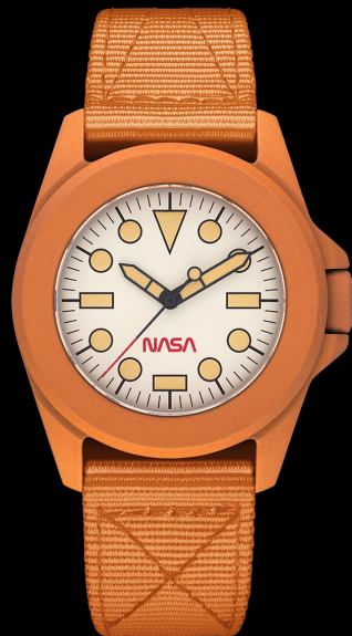
UT4-SPT, 2025 in collaboration with Massena Lab & NASA