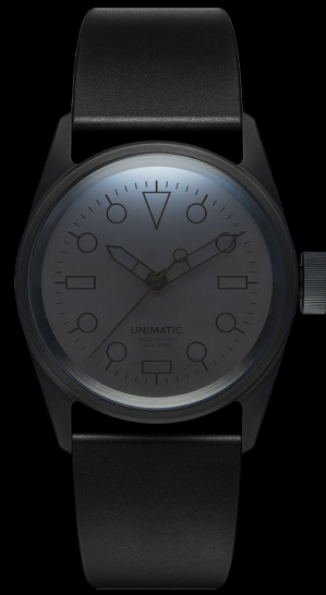
U5S-AN, 2024 Edition of 300 pieces