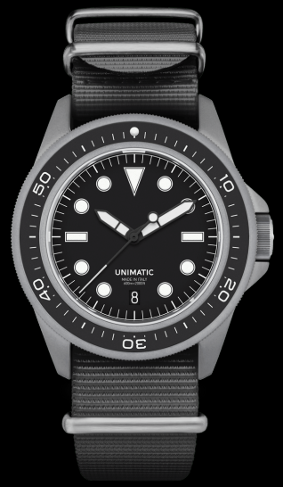
U1S-T-PD6-B, 2025 Edition of 300 pieces