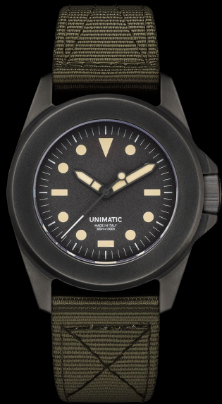
UT4-JDM, 2025 Edition of 50 pieces