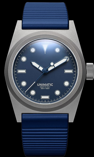
U2S-T-MP, 2022 Edition of 500 pieces