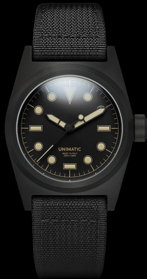
U2S-8BB, 2024 Edition of 99 pieces