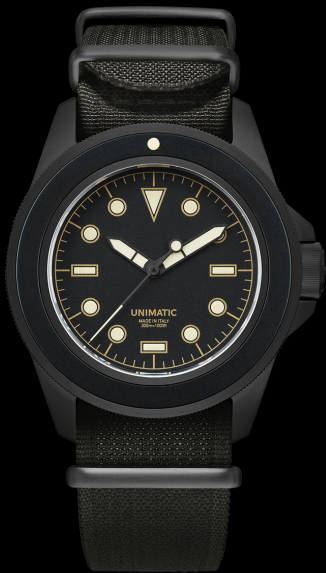
U1S-8BB, 2024 Edition of 99 pieces