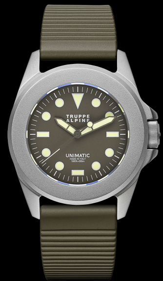
U4-TA, 2022 Edition of 200 pieces