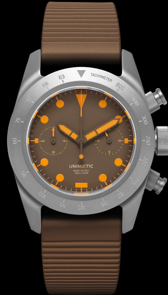
U3FB-AAS, 2025 Edition of 150 pieces