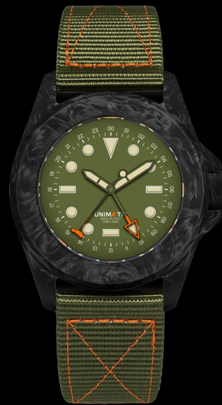
U4S-C-GMT-AA, 2024 Friends and family, edition of 10 pieces