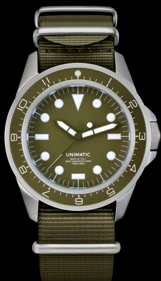
U1-DZ, 2017 Edition of 400 pieces