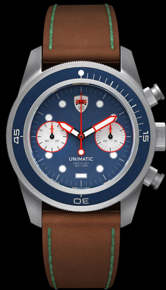
U3S-CIT, 2024 Edition of 80 pieces