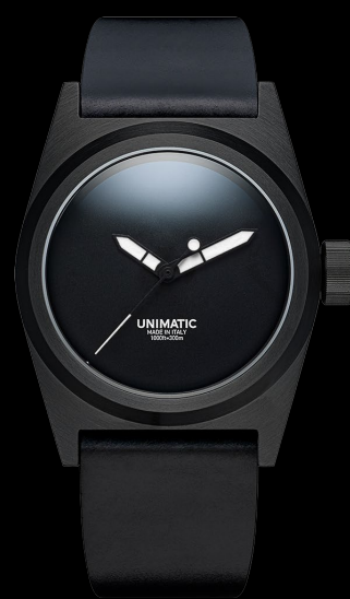
U2S-MN, 2022 Edition of 400 pieces