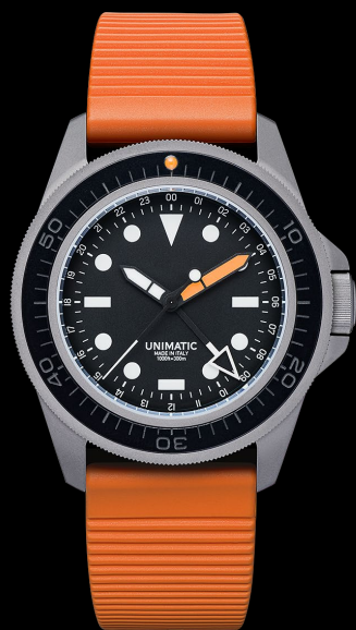
U1S-T-GMT-ET, 2024 Edition of 150 pieces in collaboration with EXQUISITE TIMEPIECES