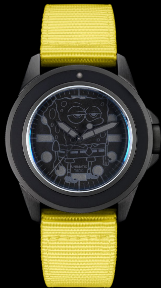
U1-SS, 2019 Edition of 50 pieces in collaboration with SPONGEBOB SQUAREPANTS