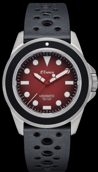
U1-ER, 2022 Edition of 300 pieces in collaboration with ERROICA