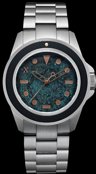
U1-NRN, 2021 Edition of 39 pieces