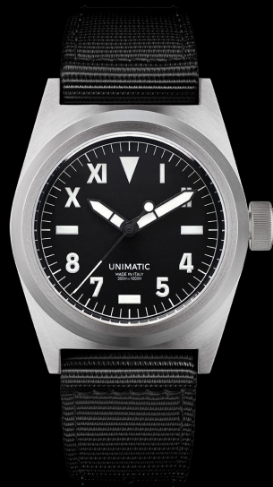
U2-JDM, 2025 Edition of 100 pieces