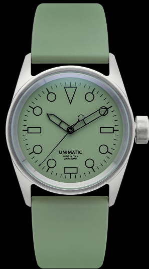
U5S-MP, 2024 Edition of 50 pieces in collaboration with MR PORTER