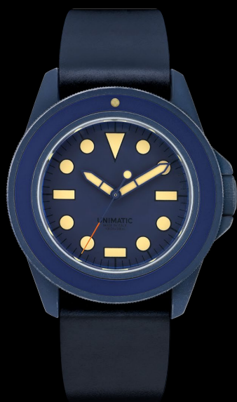
U1-MY, 2019 Edition of 50 pieces in collaboration with MIHARA YASUHIRO