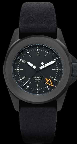
U4-TS24WB, 2025 Edition of 150 pieces