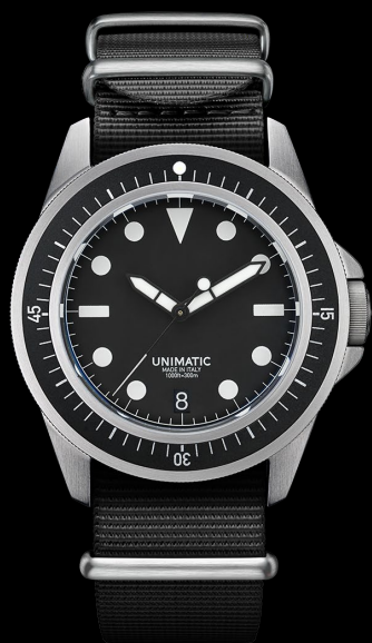
U1-FD, 2020 Edition of 600 pieces