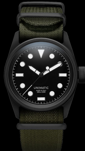
U5S-BLN, 2026 Edition of 300 pieces