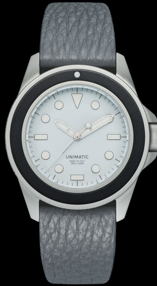
UT1-GO, 2025 Edition of 300 pieces