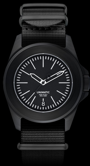
U4-BLB, 2025 Edition of 99 pieces