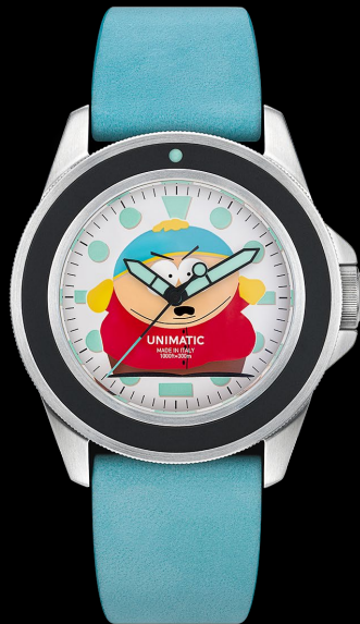
U1-EC, 2023 Edition of 100 pieces in collaboration with SOUTH PARK