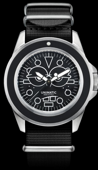
U1-SS3, 2020 Edition of 100 pieces