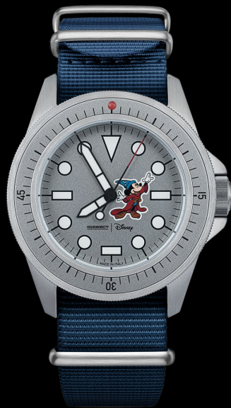
U1S-HS, 2022 Edition of 100 pieces in collaboration with HIGHSNOBIETY & DISNEY