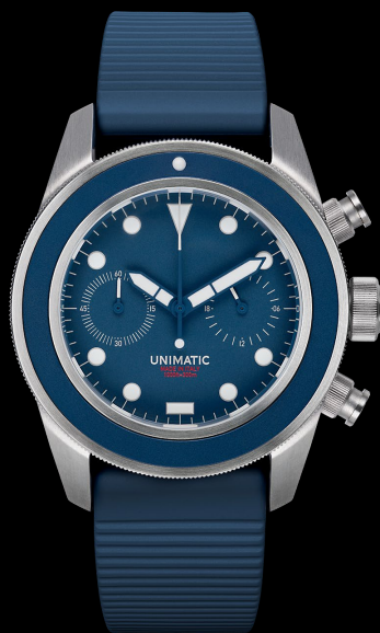
U3-FFF, 2021 Edition of 200 pieces in collaboration with FIVE FORTYFIVE New Zealand