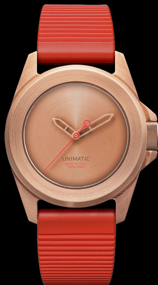
U4S-ME0B, 2023 Edition of 50 pieces