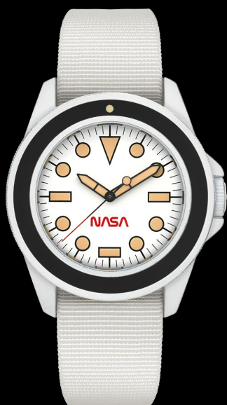
U1-SP, 2019 Edition of 50 pieces in collaboration with NASA