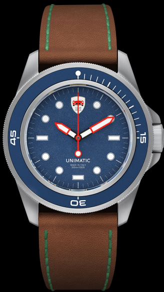
U1S-CIT, 2024 Edition of 80 pieces