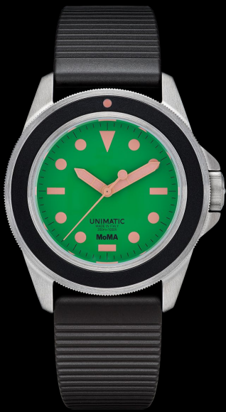
U1-MoMA-G, 2023 Edition of 66 pieces