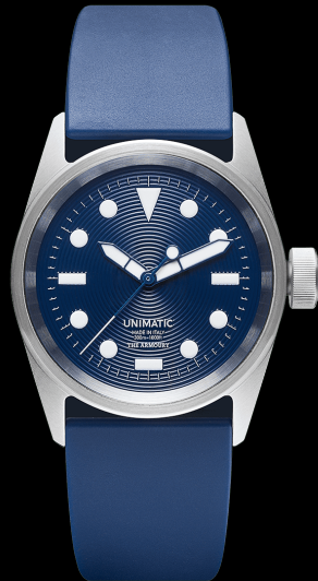
U5S-TA, 2024 Edition of 50 pieces in collaboration with THE ARMOURY