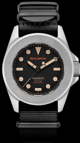
U4-RE, 2023 Edition of 122 pieces in collaboration with ROYAL ENFIELD