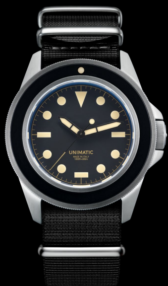
U1-B, 2016 Edition of 200 pieces