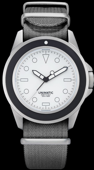
U1-FL, 2024 Edition of 100 pieces