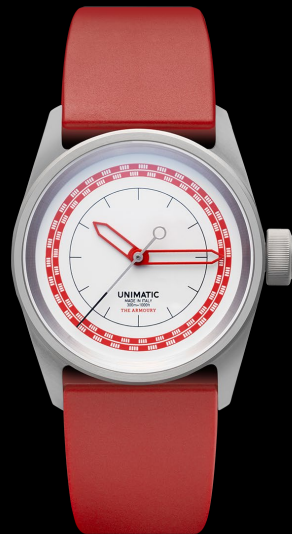
USS-TA2, 2025 Edition of 120 pieces in collaboration with THE ARMOURY