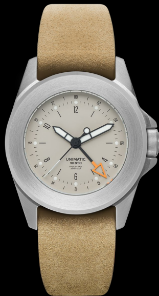
U4-TS24W, 2025 Edition of 250 pieces