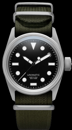
U5S-BL, 2026 Edition of 300 pieces