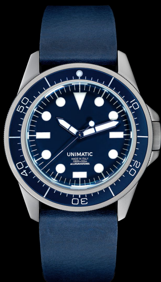
U1-DL, 2017 Edition of 50 pieces in collaboration with LUISAVIAROMA