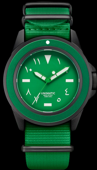
U1-KSA, 2021 Edition of 99 pieces in collaboration with VELOCE LIFE