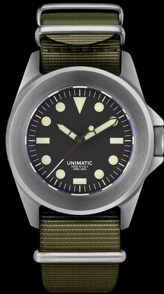
U4-A, 2020 Edition of 500 pieces