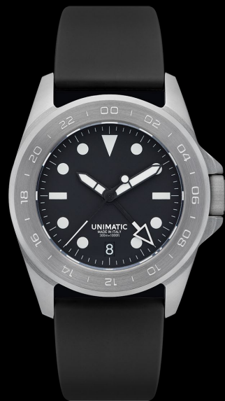
U4-GMT, 2024 Edition of 300 pieces