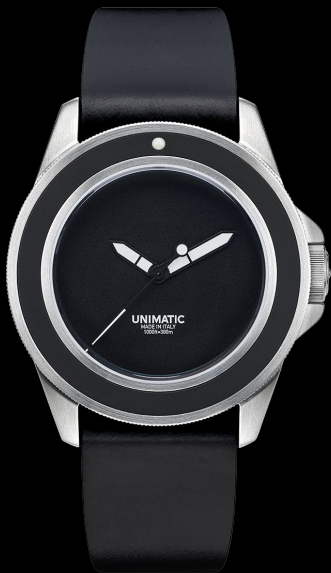
U1S-M, 2022 Edition of 500 pieces