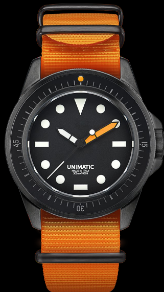
U1S-ET, 2023 Edition of 100 pieces in collaboration with EXQUISITE TIMEPIECES