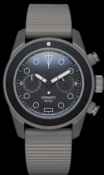
U3-U, 2021 Edition of 100 pieces in collaboration with UNCRATE