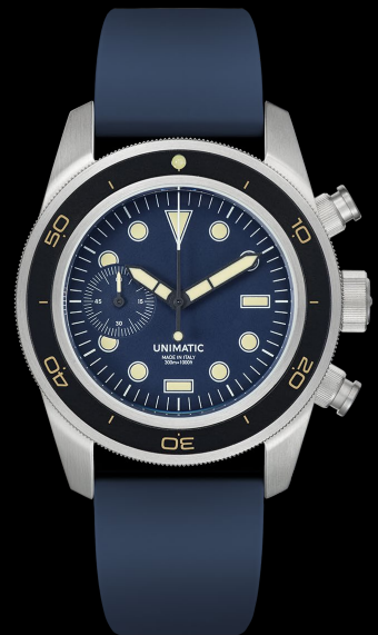
U3-DHN, 2025 Edition of 300 pieces