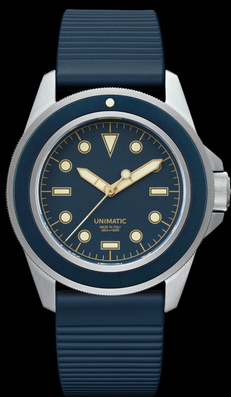
U1S-8N, 2023 Edition of 400 pieces