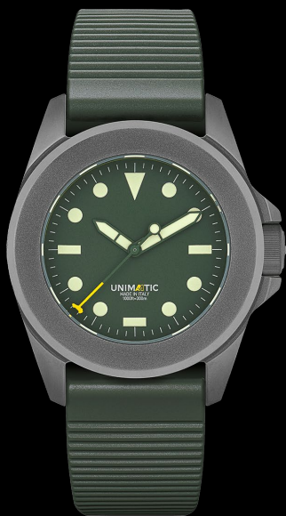
UT4-AA, 2022 Edition of 50 pieces