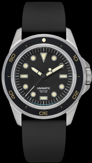
U1-DHB, 2025 Edition of 300 pieces