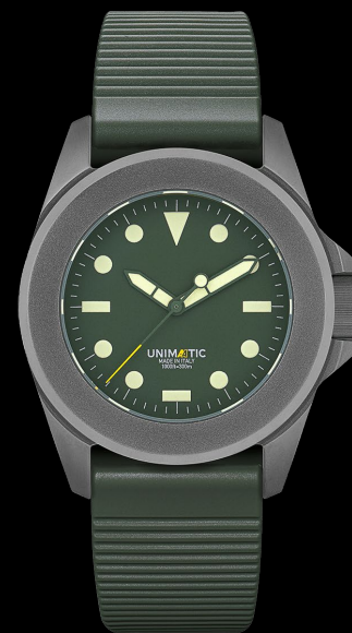
UT4-AA2, 2022 Edition of 150 pieces