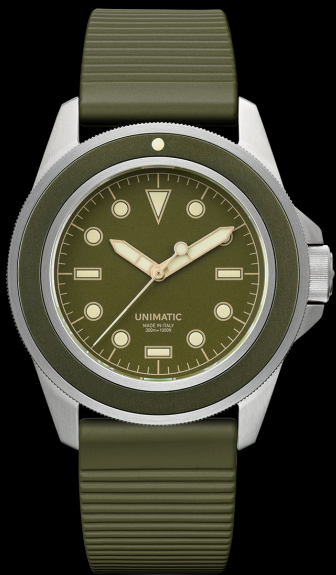
U1S-80, 2023 Edition of 400 pieces