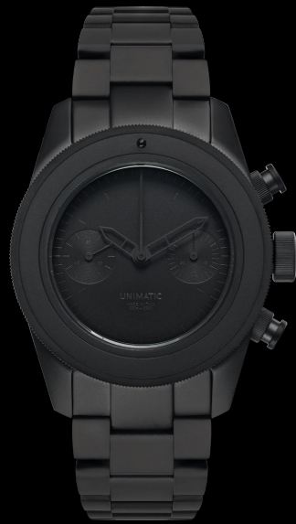
U3S-M, 2025 Edition of 30 pieces in collaboration with MAXFIELD Los Angeles