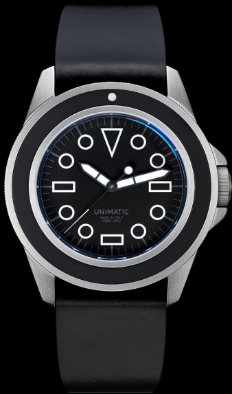
U1-EM, 2018 Edition of 400 pieces