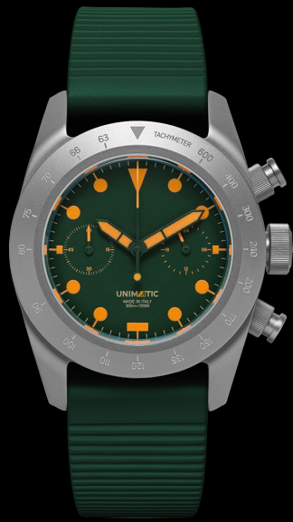
U3FB-AAG, 2025 Edition of 150 pieces