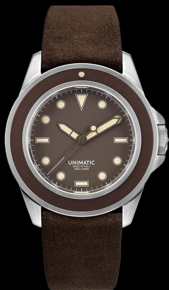
U1S-MB, 2022 Edition of 500 pieces