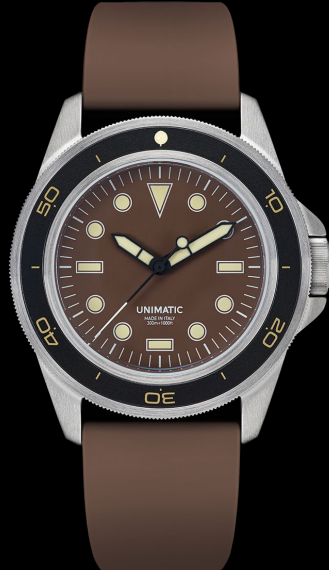
U1-DHBR, 2025 Edition of 300 pieces