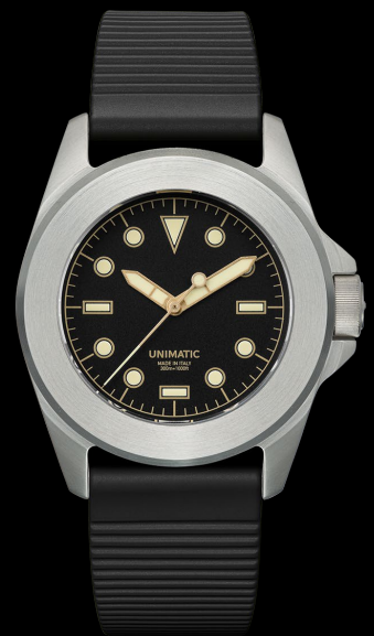
U4S-8B, 2023 Edition of 400 pieces