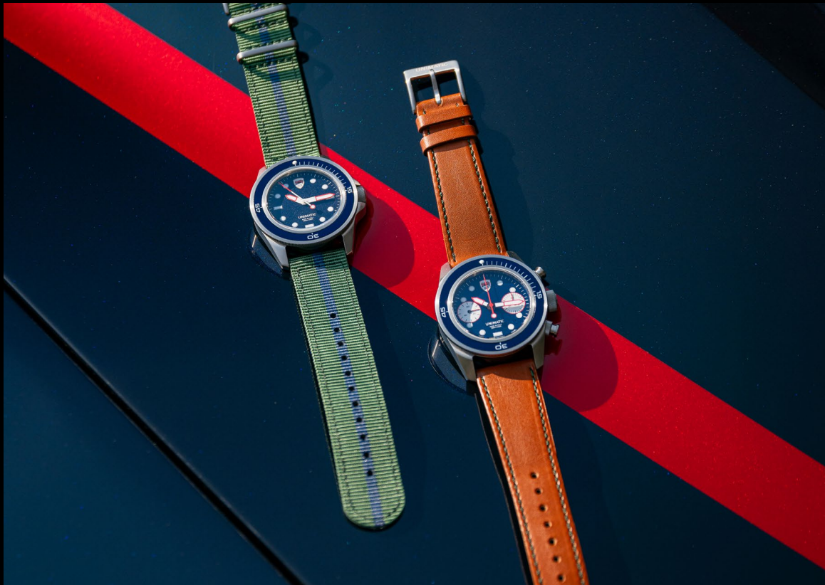
UNIMATIC x Club Italia - ref. U1S-CIT and U3S-CIT