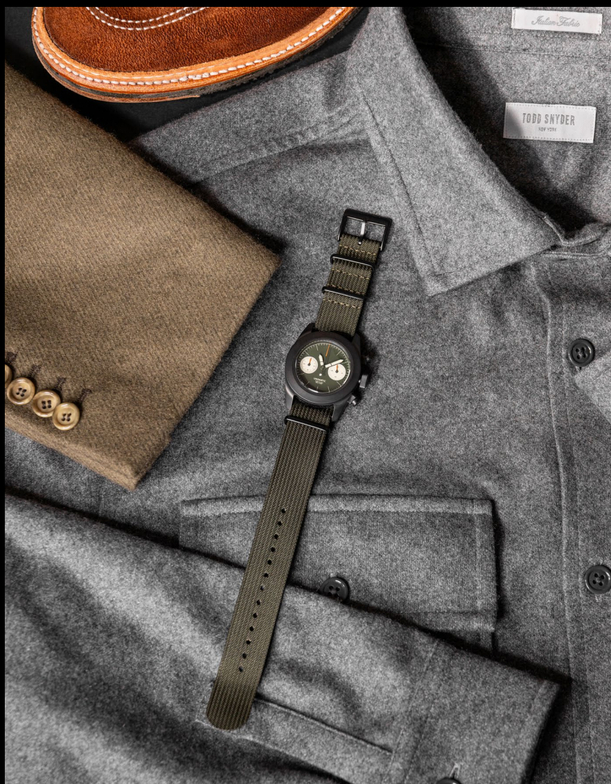
UNIMATIC x Todd Snyder - ref. U3FB-TS

Founded in 2015 by Giovanni Moro and Simone Nunziato, industrial designers trained at Politecnico di Milano, UNIMATIC is a distinctive Italian brand that blends iconic watch inspiration with a unique design language. Rooted in Italian design excellence, the brand focuses on a streamlined aesthetic that emphasizes value, functionality, authenticity, and innovation.