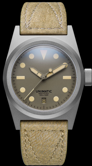
U2S-T-W, 2025 Edition of 150 pieces