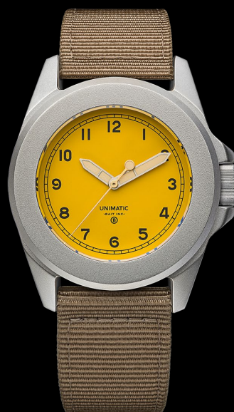
U4-BTY, 2022 Edition of 50 pieces