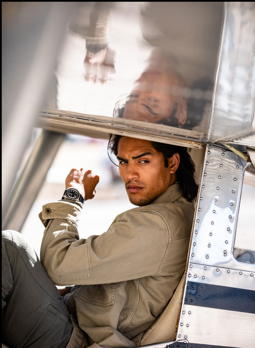
UNIMATIC x Hodinkee - ref. U1-HGMT