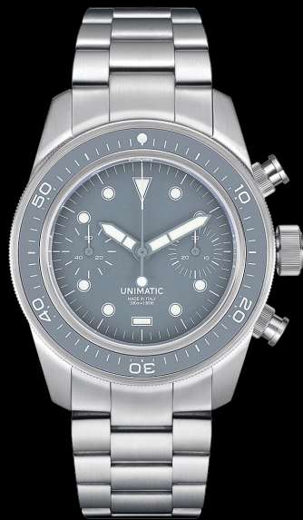
U3S-HS, 2025 Edition of 36 pieces in collaboration with HENRY SINGER