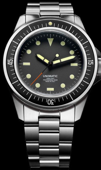
U1-A, 2015 Edition of 300 pieces