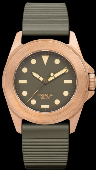
U4S-BRZ-ML, 2022 Edition of 400 pieces