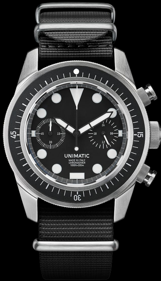
U3-F, 2019 Edition of 600 pieces