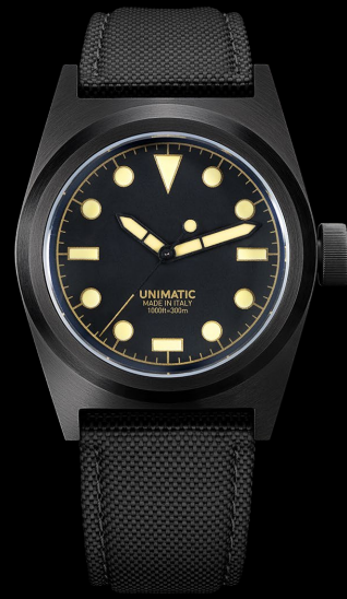
U2-CN, 2018 Edition of 200 pieces