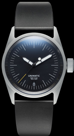
U5S-ML, 2023 Edition of 300 pieces