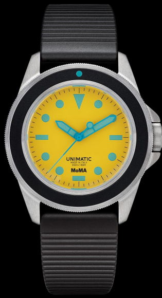
U1-MoMA-Y, 2023 Edition of 67 pieces