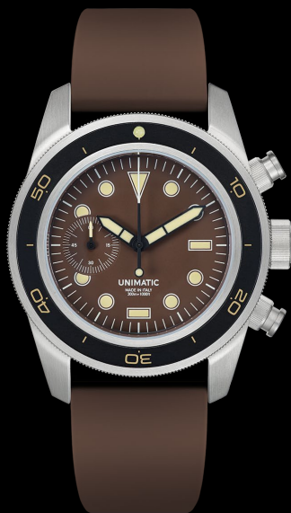
U3-DHBR, 2025 Edition of 300 pieces