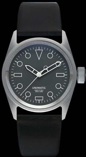
U5S-A, 2024 Edition of 300 pieces