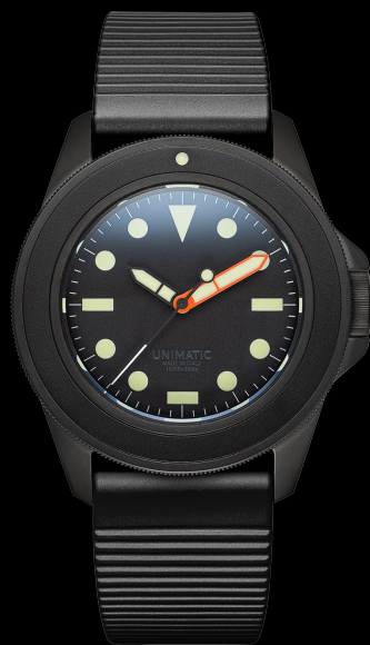
U1-MLBN, 2021 Friends and family, edition of 80