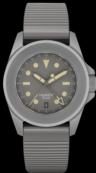
U4S-T-HS, 2023 Edition of 100 pieces in collaboration with HENRY SINGER