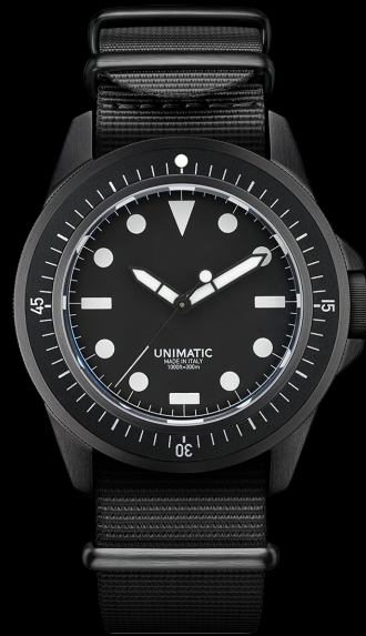
U1-FN, 2019 Edition of 300 pieces