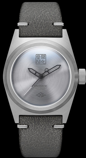
U2-KKD, 2025 Edition of 150 pieces in collaboration with KAIKADO and ERG