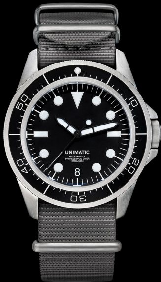
U1-D, 2017 Edition of 600 pieces