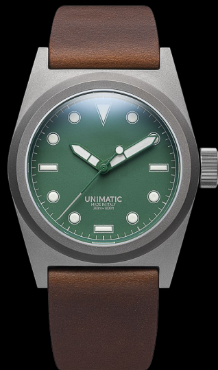
U2S-T-L, 2022 Edition of 99 pieces in collaboration with LORENZI Milano