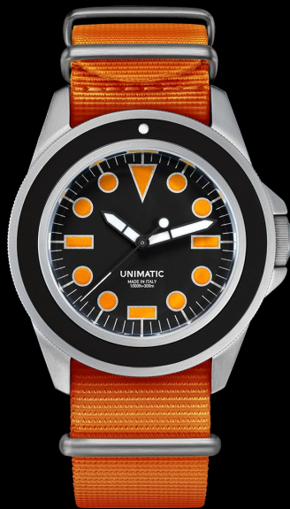
U1-DHK, 2017 Edition of 30 pieces in collaboration with WOAW Hong Kong