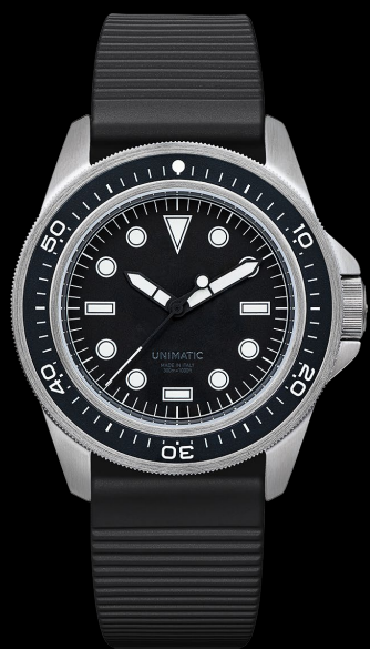
U1S-PD3, 2023 Edition of 500 pieces