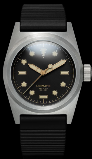
U2S-8B, 2023 Edition of 400 pieces