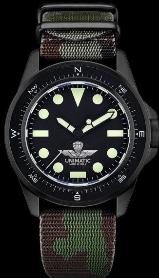
U1-PAN, 2022 Edition of 150 pieces