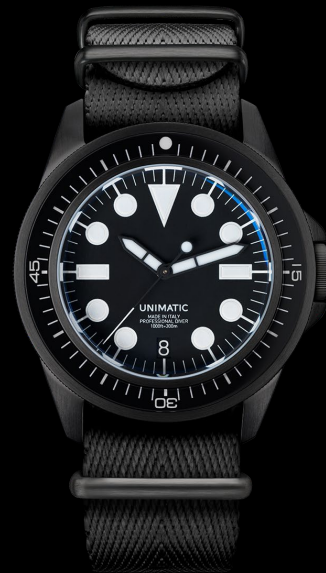
U1-EN, 2018 Edition of 300 pieces