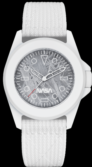
U4S-T-SPW, 2025 Edition of 60 pieces in collaboration with Massena Lab & NASA