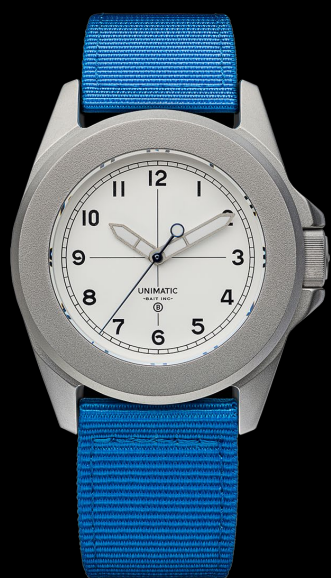
U4-BTS, 2022 Edition of 100 pieces