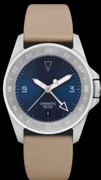
U4-GMT-MMC, 2025 Edition of 100 pieces in collaboration with MORGAN MOTOR COMPANY