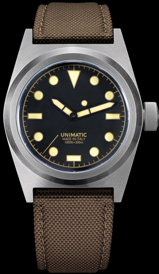
U2-C, 2018 Edition of 400 pieces