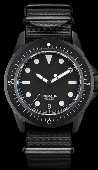
U1-FDN, 2020 Edition of 400 pieces