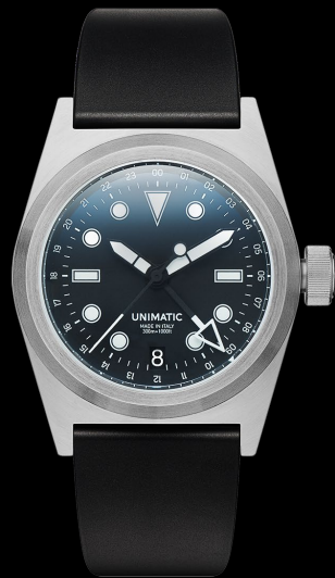
U2-GMT, 2025 Edition of 300 pieces