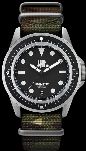
U1-U, 2020 Edition of 250 pieces