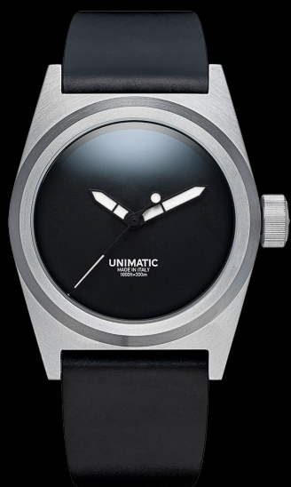
U2S-M, 2022 Edition of 500 pieces