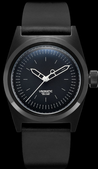
U2-RA, 2024 Edition of 100 pieces