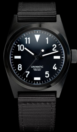
U2-BN, 2017 Edition of 250 pieces