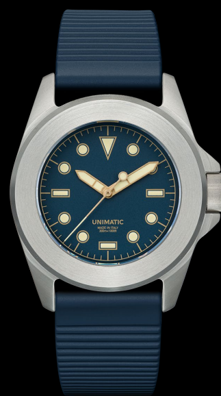
U4S-8N, 2023 Edition of 400 pieces