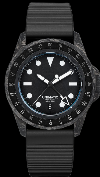
U1S-C-GMT-H, 2023 Edition of 250 pieces