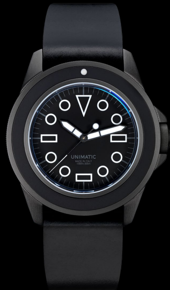
U1-EMN, 2018 Edition of 200 pieces