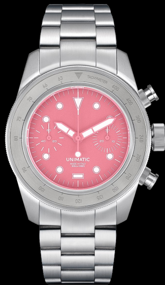
U3S-HS, 2025 One of One in collaboration with HENRY SINGER