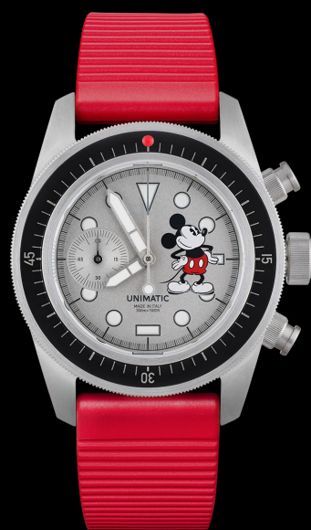
U3-HS, 2023 Edition of 100 pieces