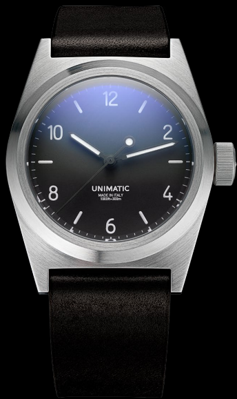
U2-AB, 2016 Edition of 150 pieces