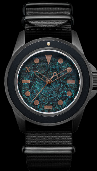
U1-NR, 2021 Edition of 54 pieces