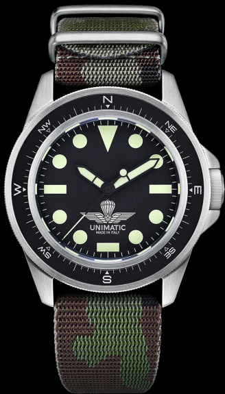
U1-PA, 2022 Edition of 300 pieces