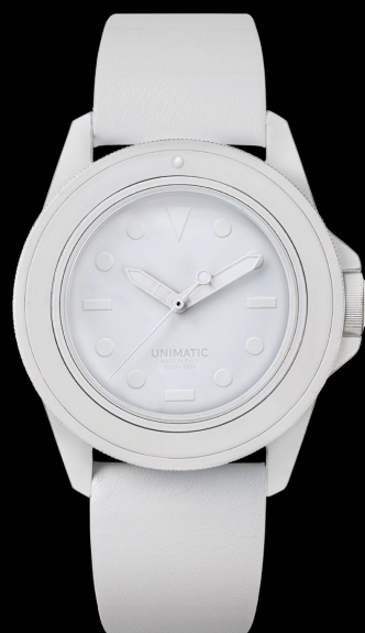
U1-MY2, 2020 Edition of 100 pieces in collaboration with MIHARA YASUHIRO