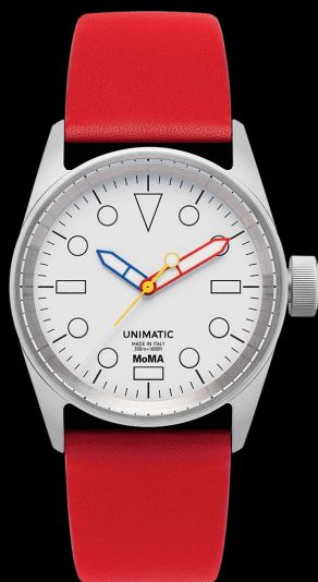
U5S-MoMA-R, 2024 Edition of 75 pieces