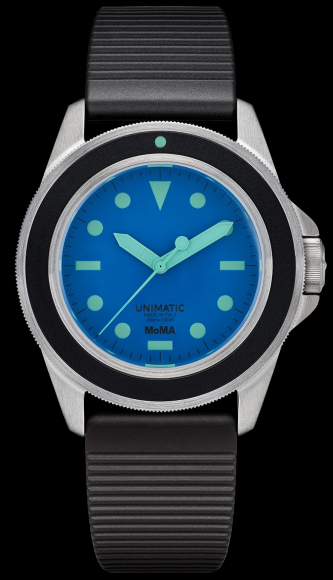
U1-MoMA-B, 2023 Edition of 67 pieces