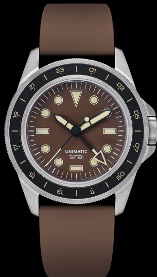
U1-GMT-DHBR, 2025 Edition of 300 pieces