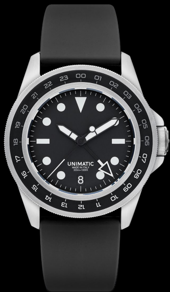
U1-GMT, 2024 Edition of 300 pieces