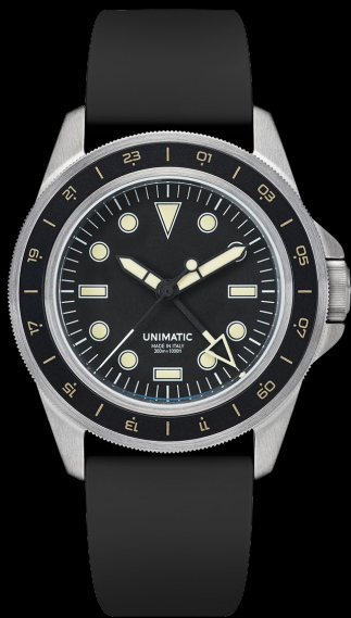
U1-GMT-DHB, 2025 Edition of 300 pieces