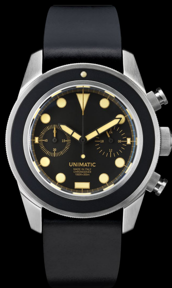
U3-A, 2018 Edition of 600 pieces