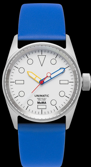
U5S-MoMA-B, 2024 Edition of 75 pieces