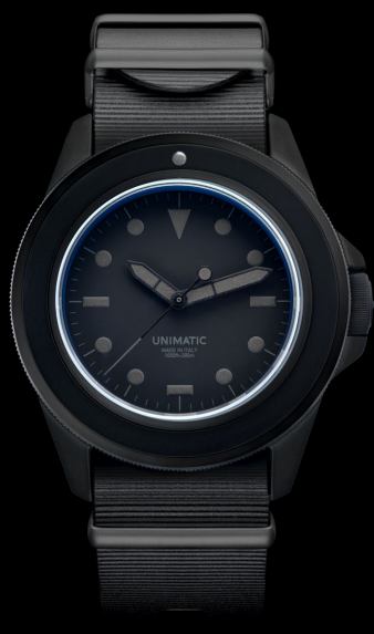
U1-C, 2016 Edition of 50 pieces in collaboration with COLETTE Paris