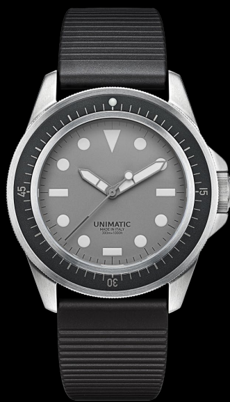
U1-H, 2021 Edition of 500 pieces