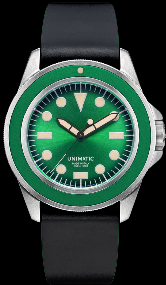
U1-SW1, 2021 Edition of 88 pieces