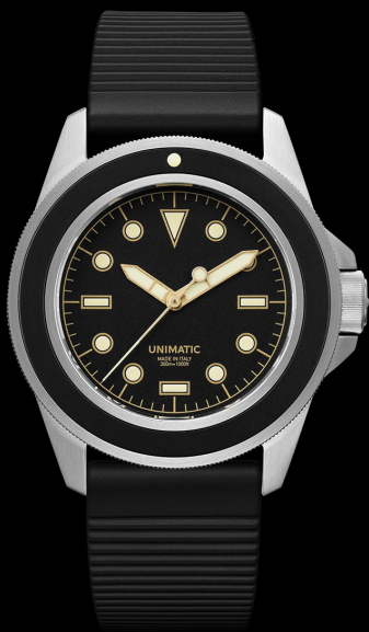
U1S-8B, 2023 Edition of 400 pieces