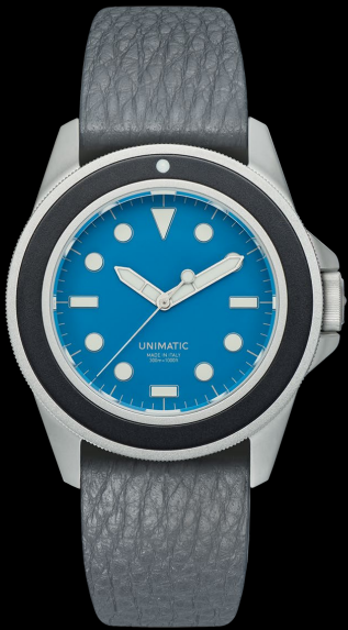
UT1-AS, 2025 Edition of 300 pieces