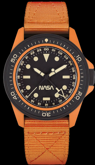
U1-SPG, 2025 Edition of 99 pieces in collaboration with Massena Lab & NASA