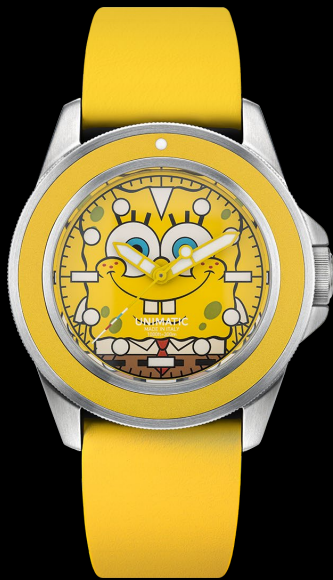
U1-SS2, 2020 Edition of 100 pieces

in collaboration with SPONGEBOB SQUAREPANTS