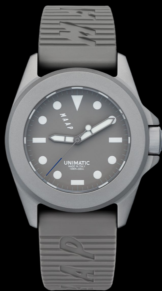
UT4-T-M, 2023 Edition of 100 pieces in collaboration with MAAP