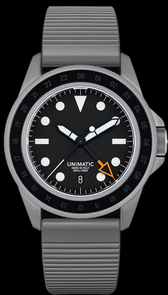
U1S-TGMT, 2022 Edition of 100 pieces