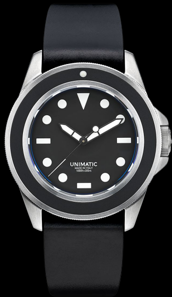
U1-FM, 2019 Edition of 400 pieces