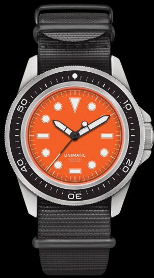
U1-PD3-OR, 2025 Edition of 300 pieces