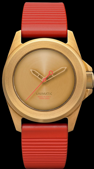
U4S-ME06, 2023 Edition of 10 pieces

in collaboration with Claesson Koivisto Rune