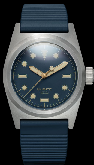
U2S-8N, 2023 Edition of 400 pieces