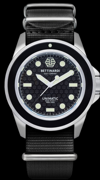
U1-BFN, 2024 Edition of 50 pieces