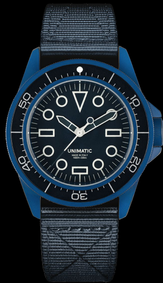
U1S-REV, 2023 Edition of 200 pieces in collaboration with REVOLUTION