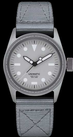
UT5-JDM, 2025 Edition of 50 pieces