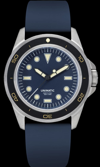
U1-DHN, 2025 Edition of 300 pieces