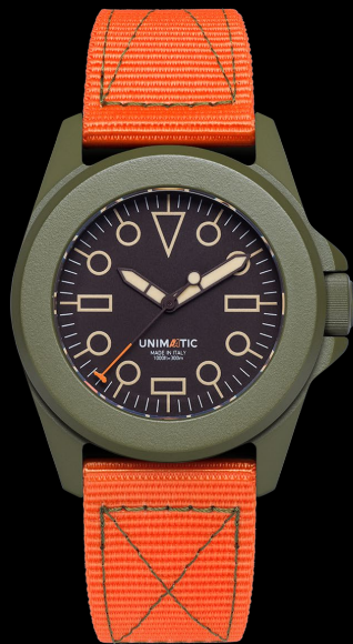
UT4-AA3, 2024 Edition of 200 pieces