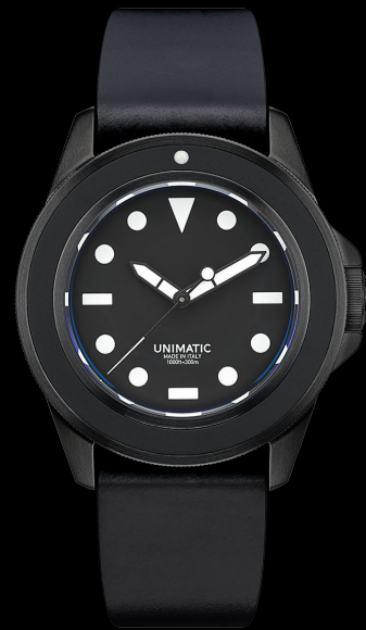
U1-FMN, 2019 Edition of 200 pieces