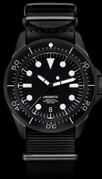
U1-DN, 2017 Edition of 300 pieces