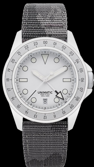
U1S-GMT-RR, 2022 Edition of 150 pieces in collaboration with REVOLUTION & THE RAKE