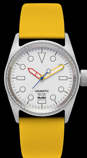
U5S-MoMA-Y, 2024 Edition of 75 pieces