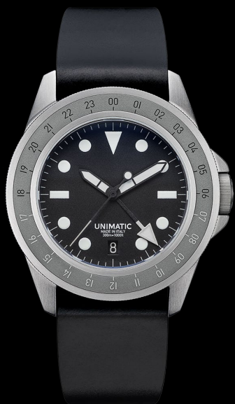
U1-HGMT, 2021 Edition of 500 pieces