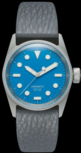
UT5-AS, 2025 Edition of 300 pieces