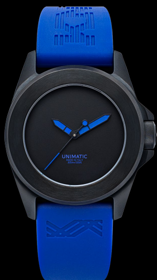
U4S-KNT, 2022 Edition of 120 pieces in collaboration with KNT-KITON