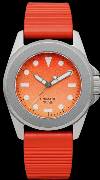
U4S-HS, 2023 Edition of 75 pieces