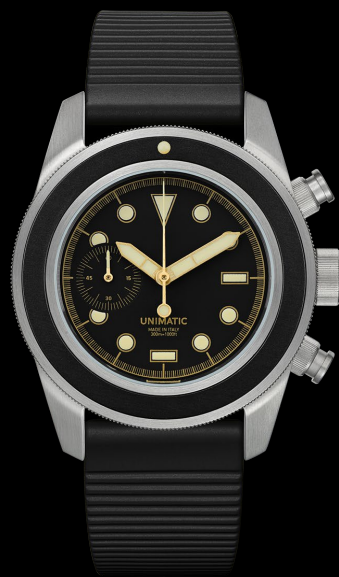
U3-8B, 2023 Edition of 400 pieces