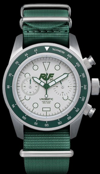
U3-RUF-G, 2024 Edition of 100 pieces