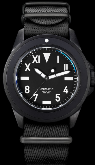
U1-NU, 2018 Edition of 50 pieces in collaboration with NOUS Paris