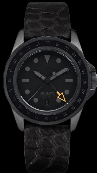
U1S-GMT-M, 2022 Edition of 100 pieces in collaboration with MAXFIELD Los Angeles