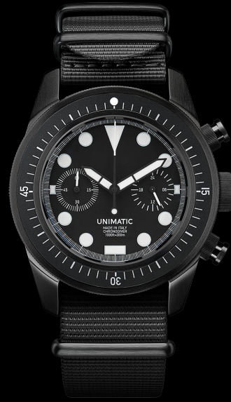
U3-FN, 2019 Edition of 300 pieces