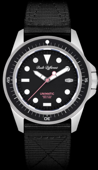
UT1-BSTN, 2025 Edition of 50 pieces in collaboration with BSTN