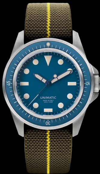
U1-MLM, 2020 Edition of 200 pieces in collaboration with MASSENA LAB