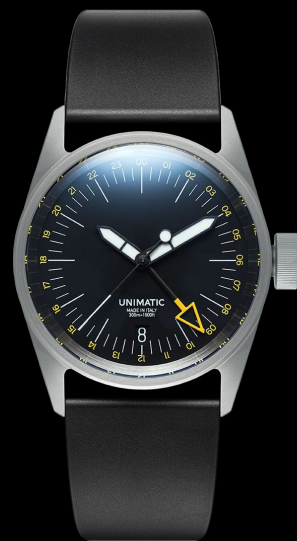
U5S-ML24, 2023 Friends and family, edition of 99 pieces