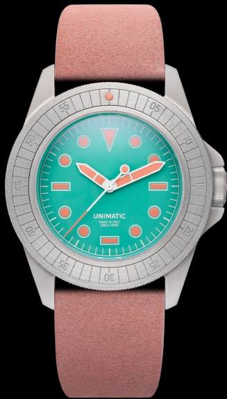
U1-R10, 2025 Edition of 300 pieces in collaboration with RIOCAM Miami