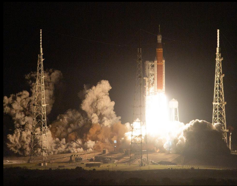
UNIMATIC x Massena LAB – ref. U1-SPG