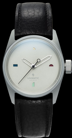
USS-NS, 2026 Edition of 30 pieces in collaboration with NICHETTO STUDIO