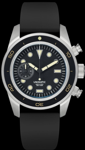
U3-DHB, 2025 Edition of 300 pieces