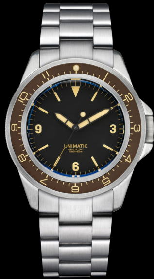
U1-BTP, 2019 Edition of 100 pieces in collaboration with BIOTOP Japan