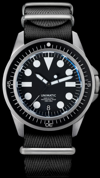
U1-E, 2018 Edition of 600 pieces