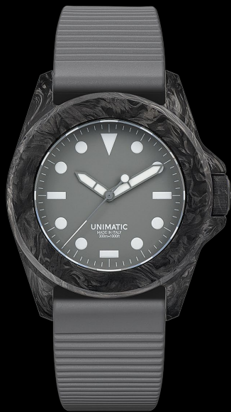
U4S-C-H, 2023 Edition of 250 pieces