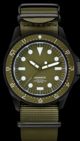
U1-DZN, 2017 Edition of 200 pieces