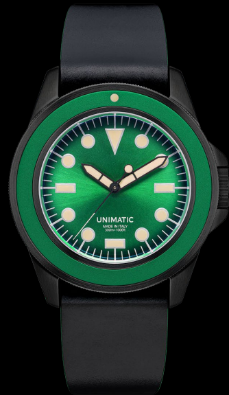
U1-SWN1, 2021 Edition of 88 pieces