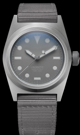
U2-F, 2020 Edition of 500 pieces