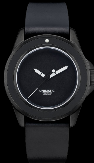
U1S-MN, 2022 Edition of 400 pieces