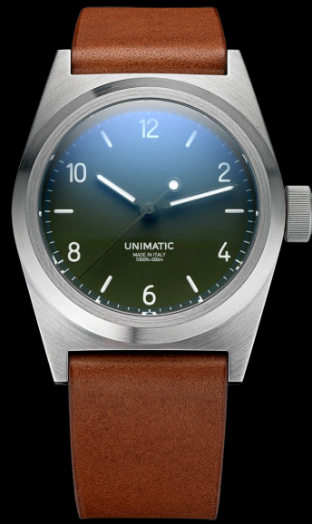
U2-AG, 2016 Edition of 150 pieces