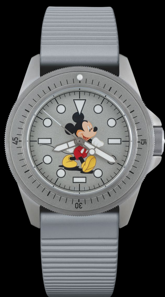
U1S-HS2, 2023 Edition of 100 pieces

in collaboration with HIGHSNOBIETY & DISNEY