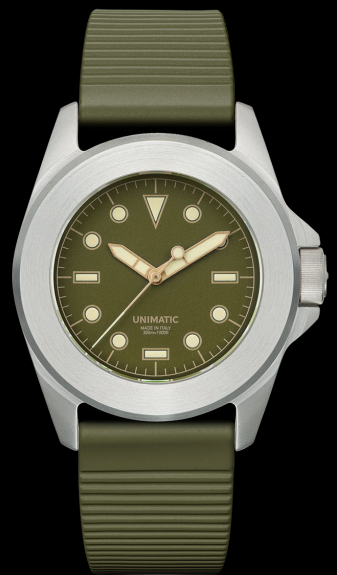
U4S-80, 2023 Edition of 400 pieces