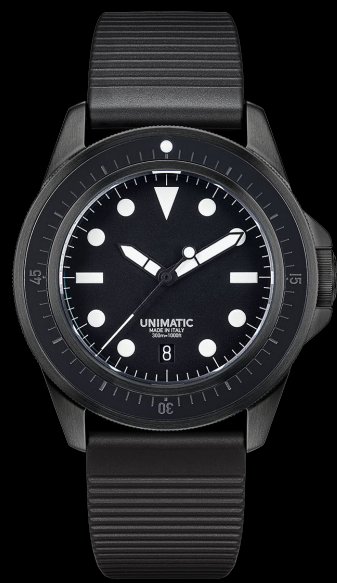
U1S-MPN, 2022 Edition of 400 pieces