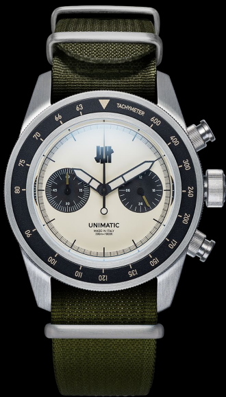
U3-ULV, 2023 Edition of 150 pieces