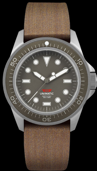
U1S-T-SE, 2025 Edition of 60 pieces in collaboration with SEASE