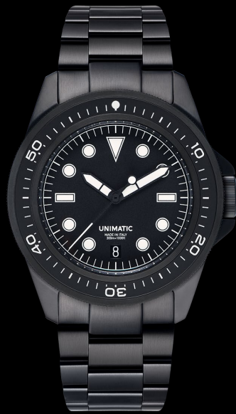
U1S-MD, 2025 Edition of 99 pieces