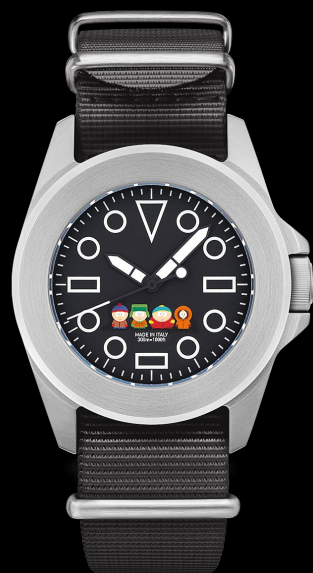
UT4-SP, 2024 Edition of 200 pieces in collaboration with SOUTH PARK